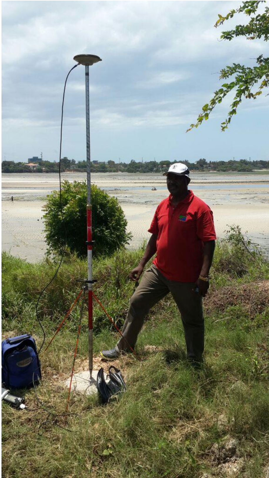
GPS OBSERVATION AT NEW SALENDER BRIDGE SITE