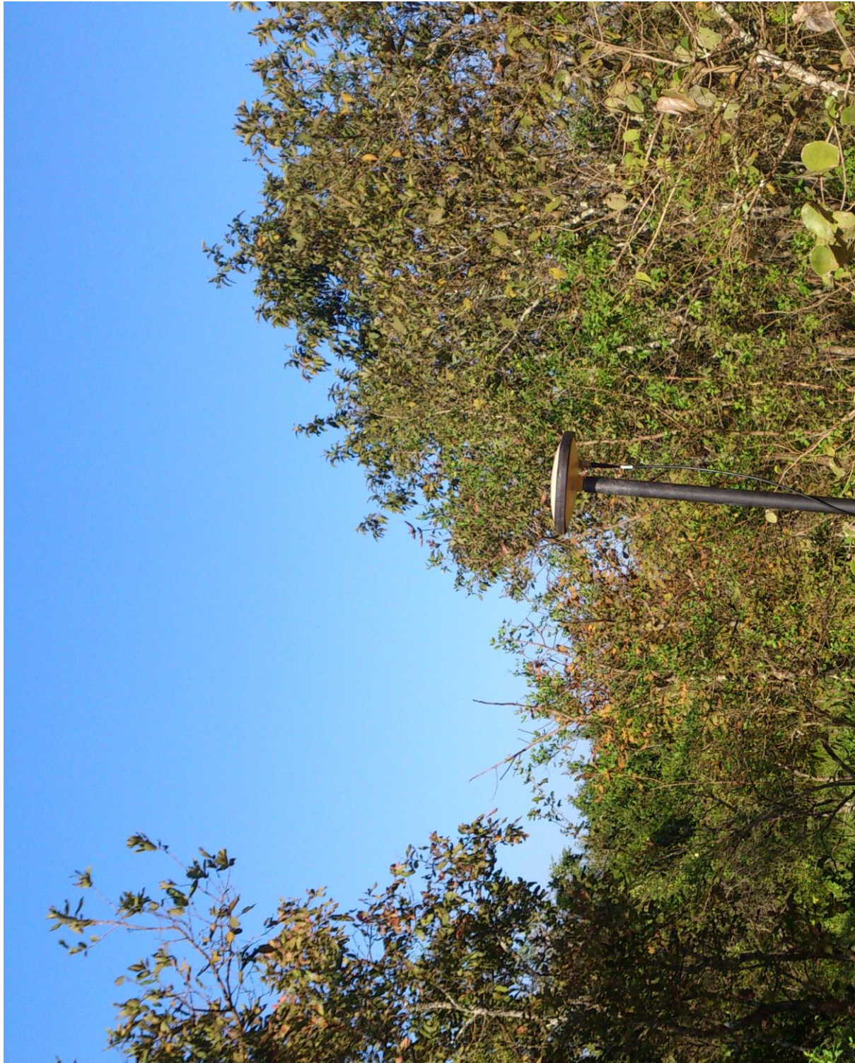
GPS OBSERVATION DURING KAYUNGA - GARILAYA DETAILED DESIGN IN UGANDA