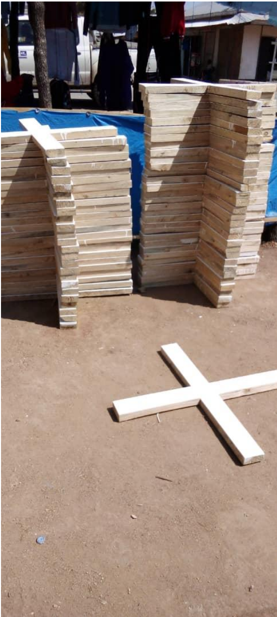
Ground Control Point Markers for Aerial Survey