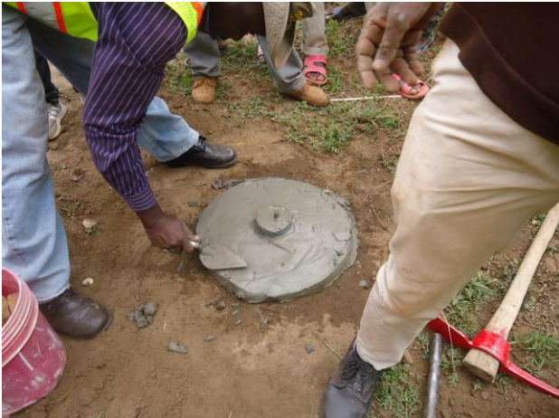
Construction of survey Primary Control Points

Year: October 2005 to December 2005 SOME PHOTOGRAPHS TAKEN DURING FIELD OPERATION IN OUR SEVERAL PROJECTS.