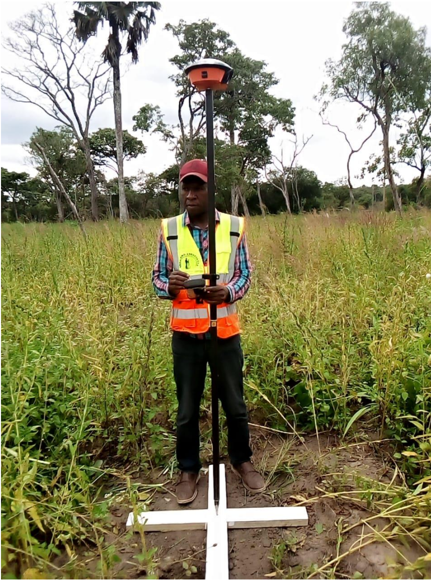
Installation and Observation of the GCPs during Drone survey for High resolution cloud free aerial orthomosaic imagery.