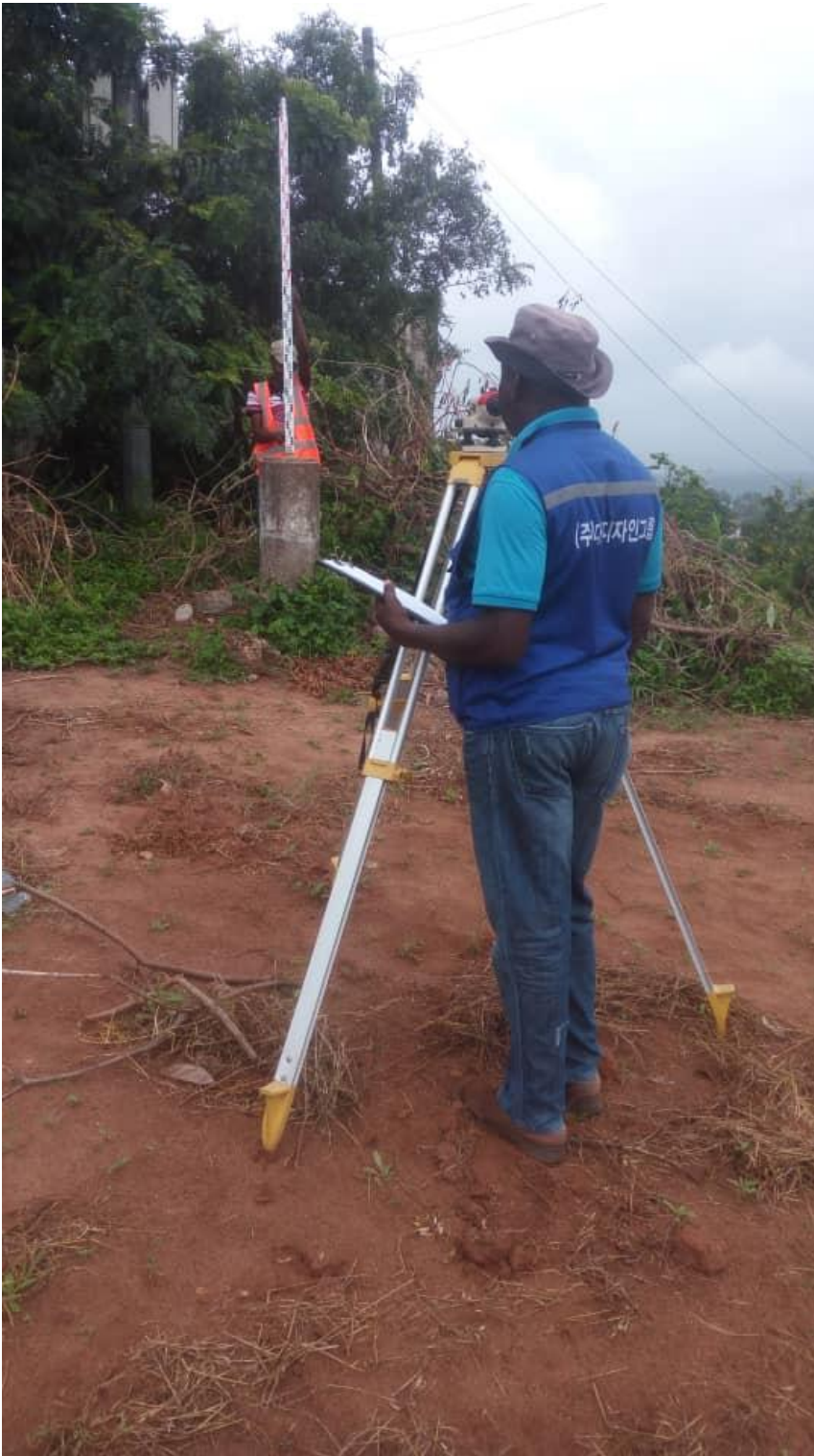
Heighting survey control points by conventional level method