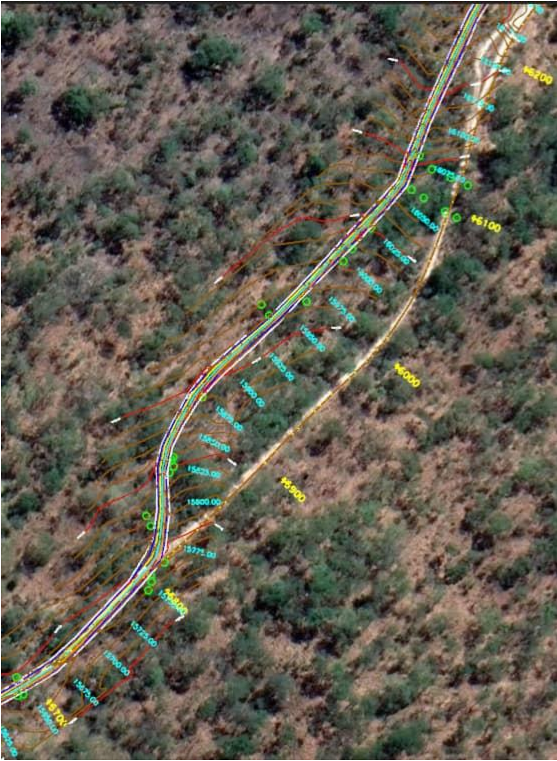
High Resolution aerial orthomosaic image from Drone survey