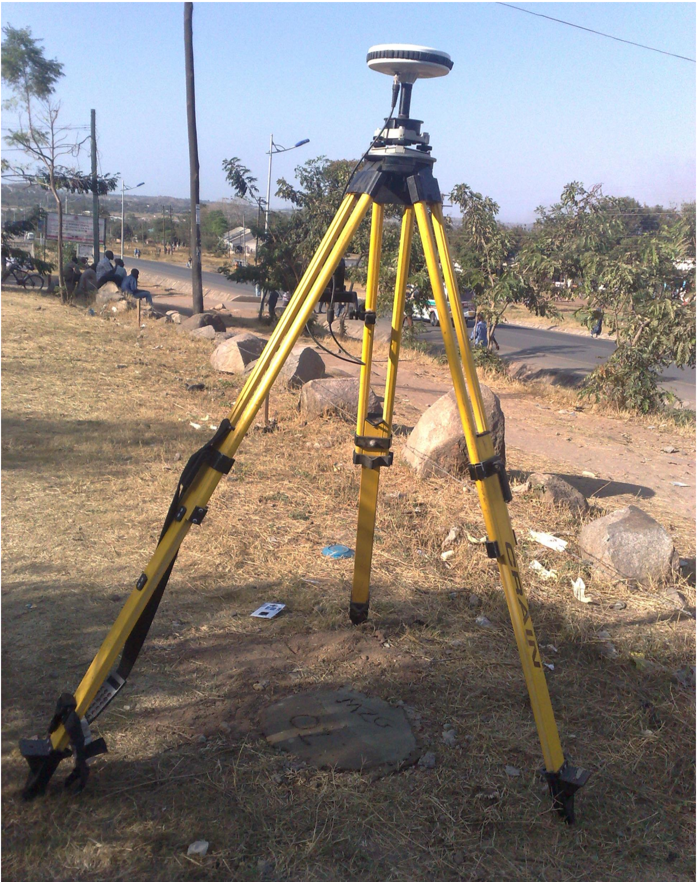
Survey Control extension during TSCP project in Mwanza city year 2014