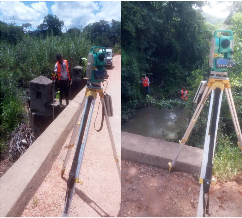
Features or Detail/Topographical survey by total station on big structures like bridge and culvert sites