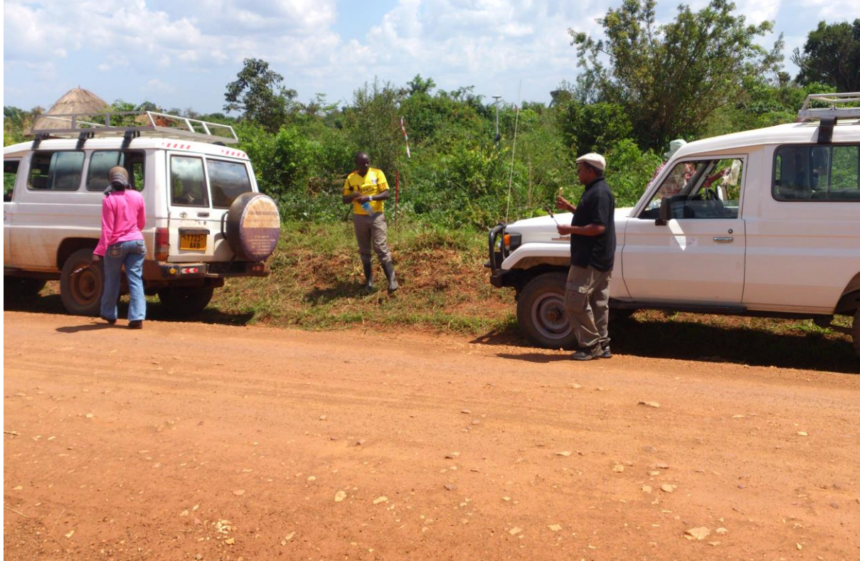
One of heavy duty Field vehicles during fieldwork at Kayunga area in the Republic of Uganda