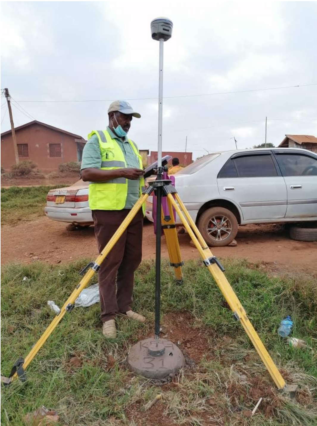
Field operations during Static GPS observations